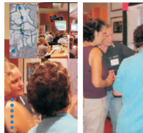
● PARTICIPANTS IN THE WEEK-LONG EBD WORKSHOP AT CAIRNS REGIONAL COUNCIL, 9-13 FEBRUARY 2009.

These and other issues will require more research before a Structure Plan for Mount Peter will be finalised in 2011. This includes more testing of population targets and development densities that are suggested by the Draft Urban Framework Plan. The Draft Urban Framework Plan will continue to be reviewed and refined as the project progresses.