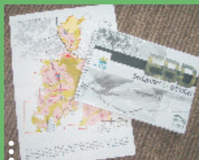
● THE DRAFT URBAN FRAMEWORK PLAN AND EBD OUTCOMES REPORT ARE AVAILABLE ONLINE AT: www.mountpetermasterplanning.com.au

These key points are described in greater detail in the EBD Outcomes Report, available online at www.mountpetermasterplanning.com.au